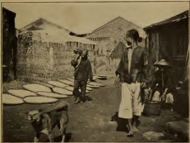
SOUTHERN VILLAGE SCENE.